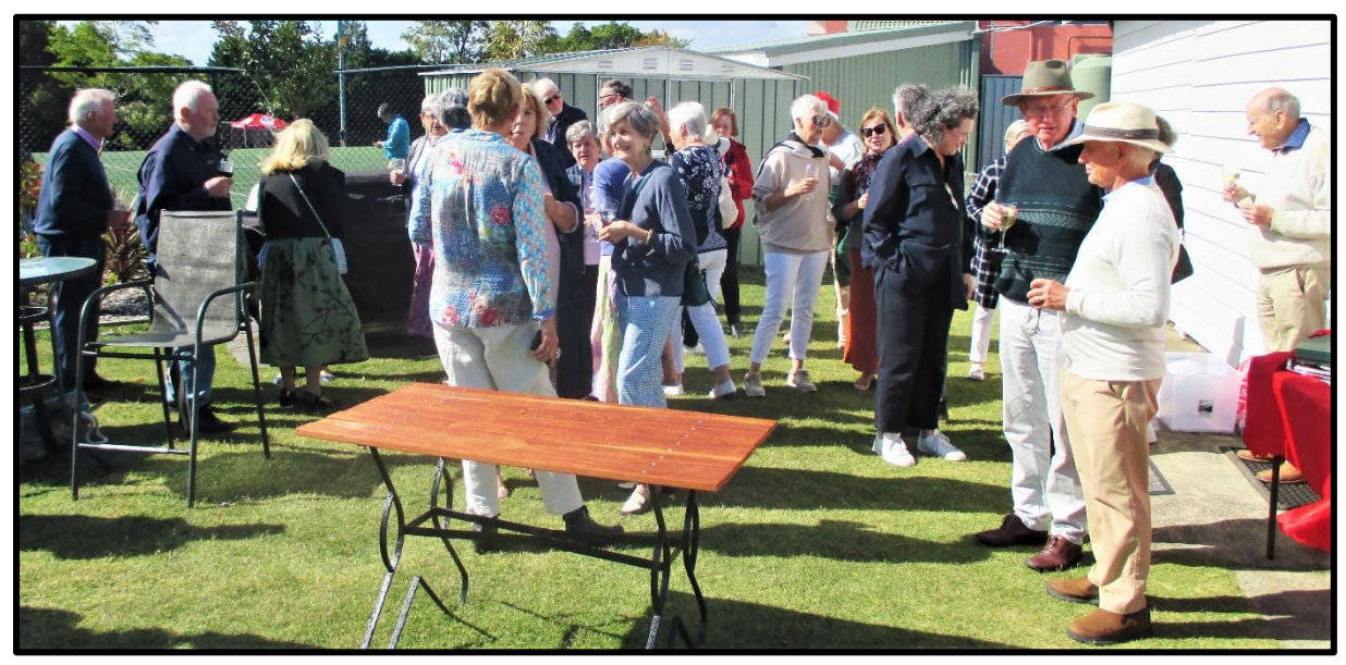
Members and partners enjoying drinks and food on a windy day at the Christmas party

A great time was had by all at the Christmas party, as the rain held off and the sun came out.