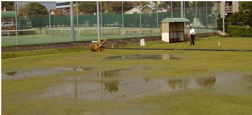
Wet lawns on Sunday