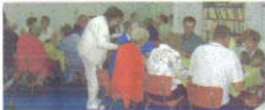
the barbecue lunch